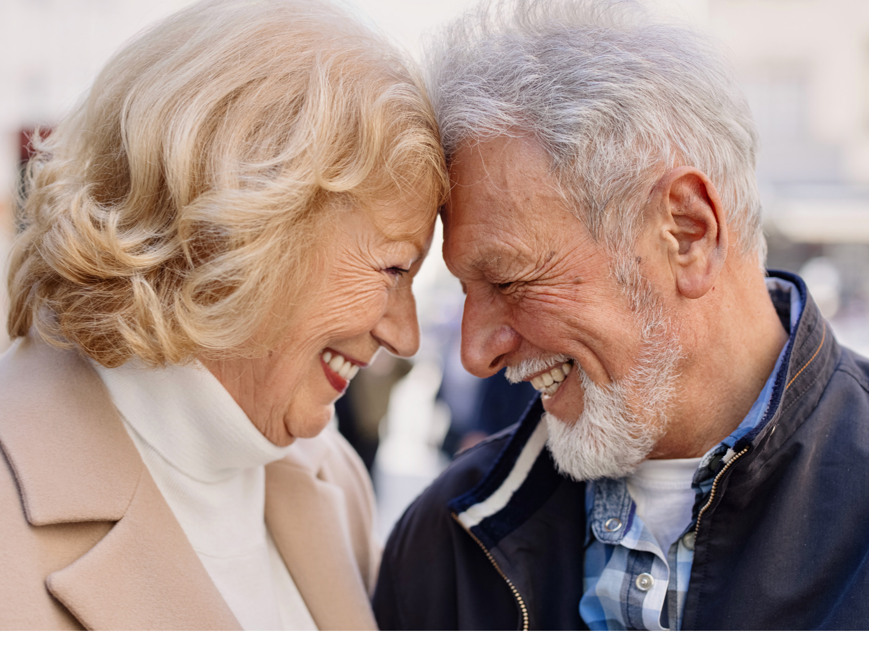
2 | Keystone First VIP Choice