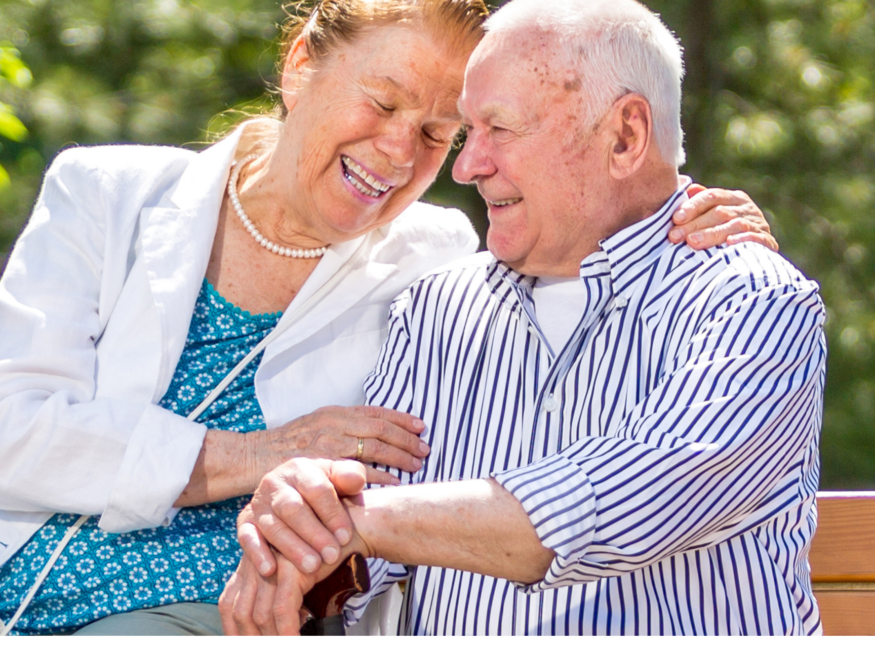
4 | Keystone First VIP Choice